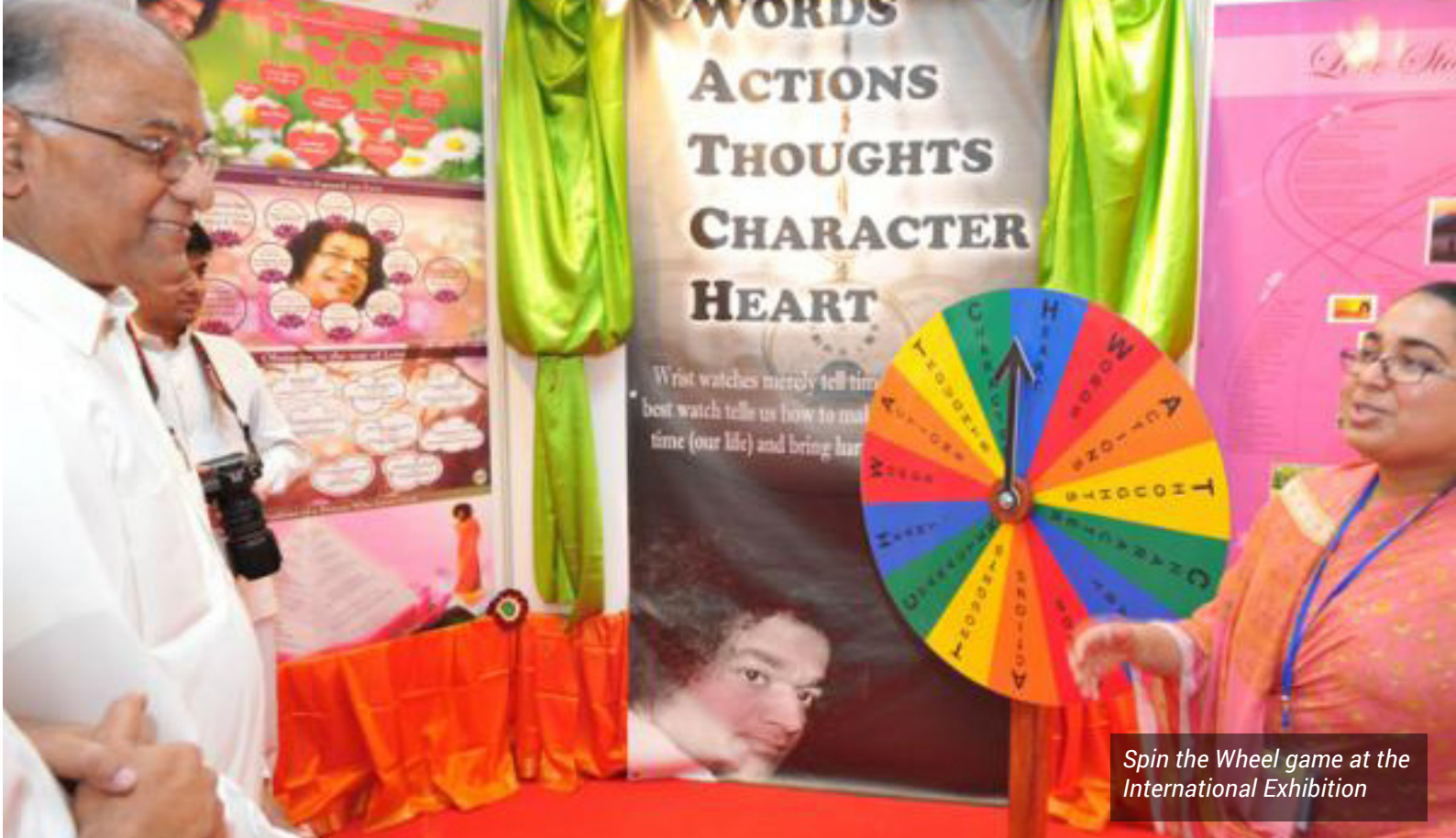
Spin the Wheel game at the International Exhibition

In a beautiful Telugu poem Swami said, "There was a great devotee of God, Prahlada. His father, Hiranyakashyapu, was the greatest scientist who could travel to the sun, the solar systems and the galaxies, in those days. He was the greatest scientist ever, but he was very agitated and unhappy.