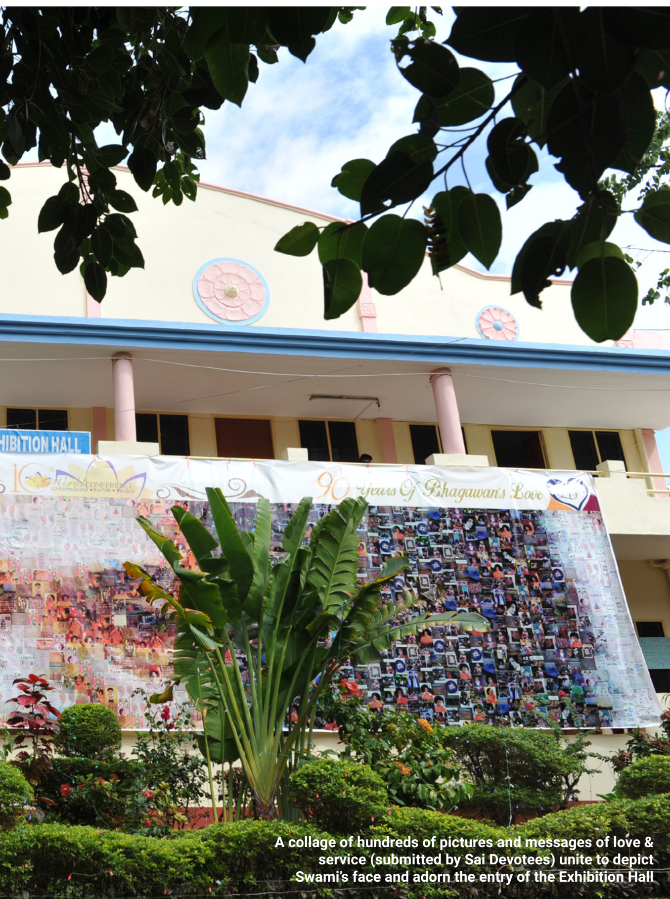
A collage of hundreds of pictures and messages of love & service (submitted by Sai Devotees) unite to depict Swami's face and adorn the entry of the Exhibition Hall