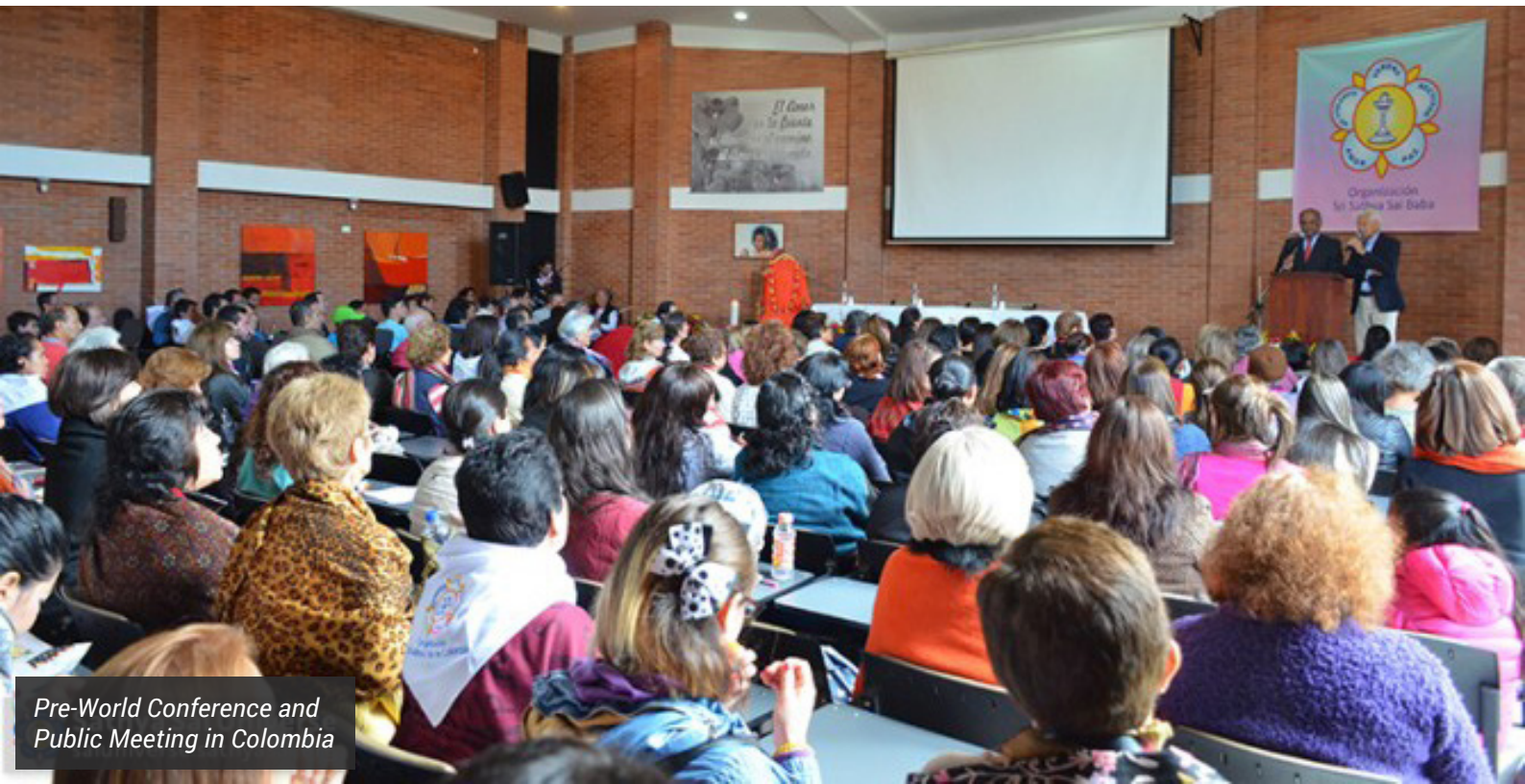
Pre-World Conference and Public Meeting in Colombia

It was amazing to witness their enthusiasm to attend this meeting after work on a weeknight. I wondered who would come in this torrential rain when I initially saw only about 100 people at 6 PM. But almost one thousand people streamed in at the starting time and filled the auditorium, and most of them were newcomers!