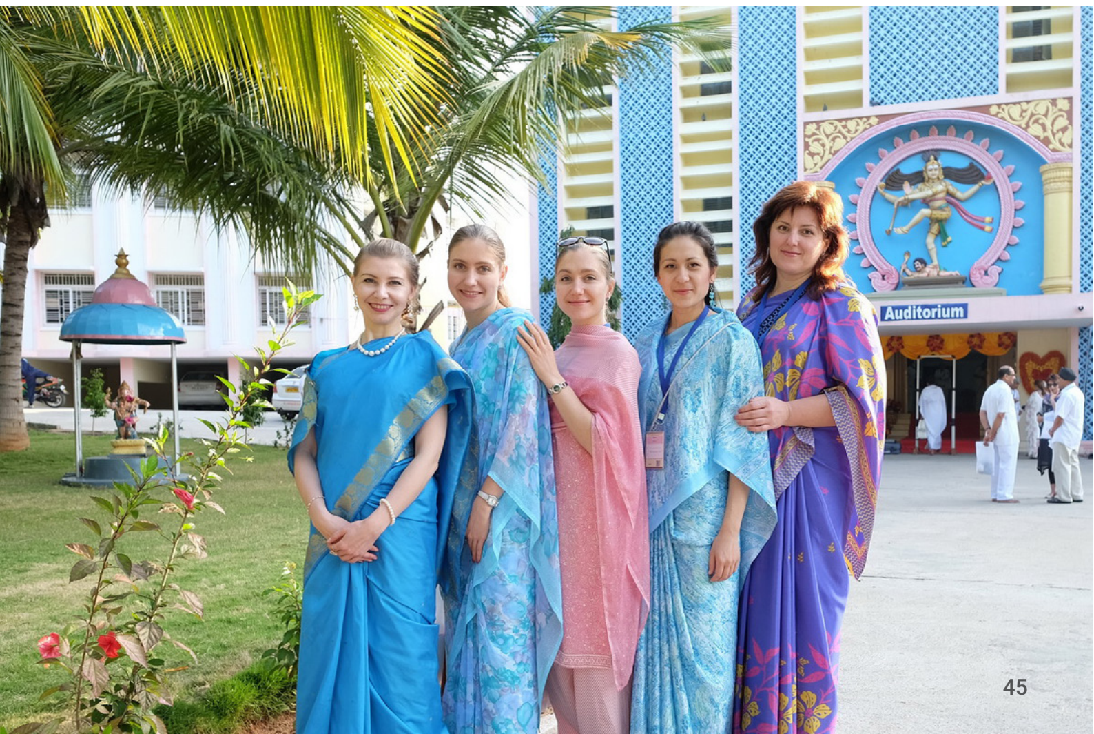
Photo below: Participants of 10th World Conference proceedings outside SSIHL Auditorium