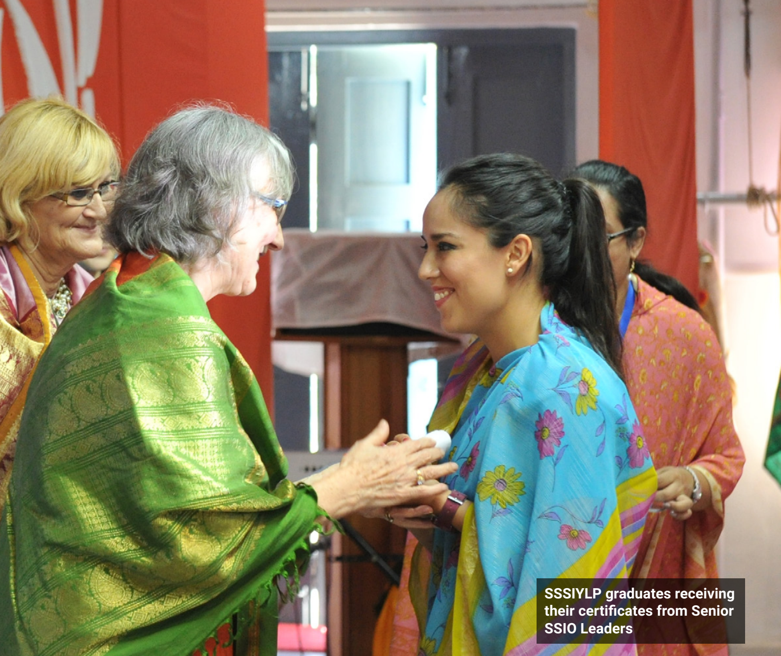
SSSIYLP graduates receiving their certificates from Senior SSIO Leaders