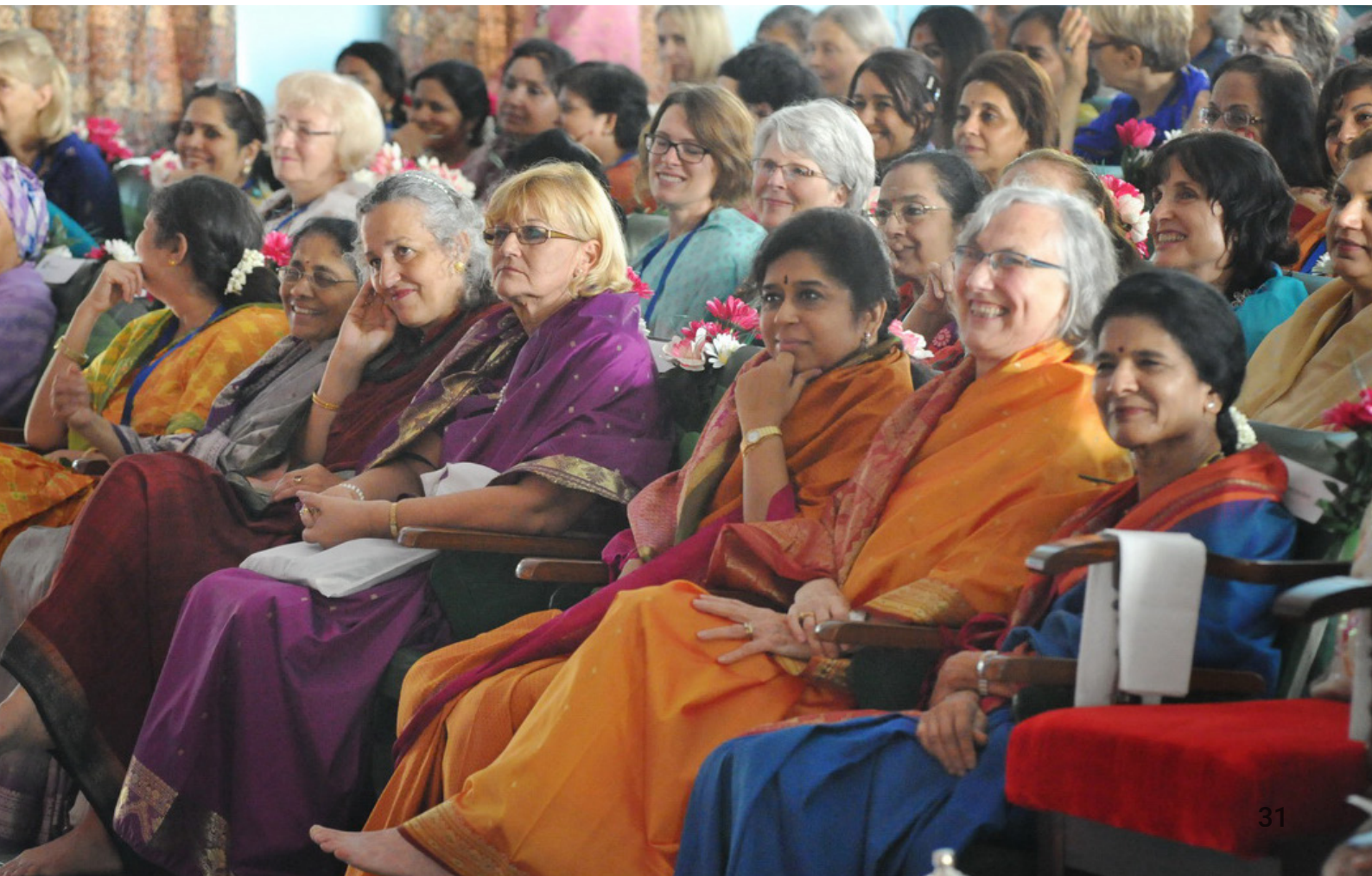
Photo below: Participants during 10 th World Conference proceedings