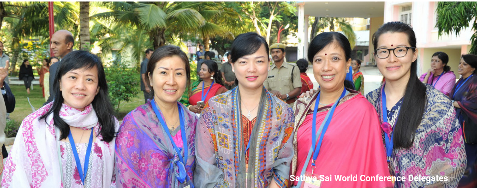
Sathya Sai World Conference Delegates

cret meditation path, thinking it was the only way to get free. Swami responded in His casual understated way: "Oh, meditation is a good way to pass the time 'till one comes to Love."