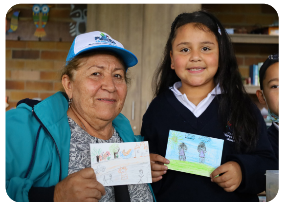
Community Service Activity in Funza, Colombia

The Sathya Sai School of Funza is supported by donations from corporations and individuals. It offers the opportunity to sponsor a child, a teacher, or a programme through one-time or recurring donations. The institution believes that a school's role, beyond serving as a pedagogical model, is to spread the message of Human Values to the community. This is why it shares information for implementing classroom programmes, as well as healthy recipes, mindfulness break techniques, and other tools that promote the practice of human values in daily life.