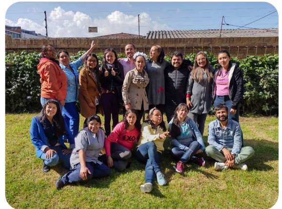
Teachers and Staff of the Sathya Sai School of Funza