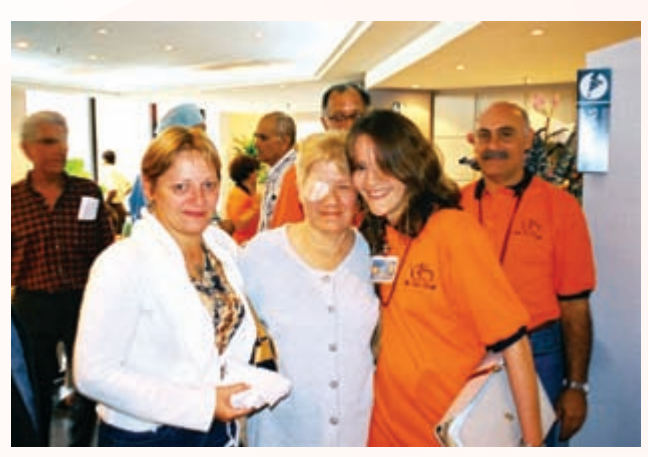
Caracas, 2003 In November 2003 the Sathya Sai Organisation in Caracas, Venezuela, conducted the third in a series of eye camps that had started in 2001. These camps involved the removal of cataracts and insertion

of multifocal lens implants for patients with little or no economic resources. Two hospitals offered their operating theatres with the latest equipment free of charge, and several pharmacies donated medicines. A total of 66 operations were performed, some of which restored full vision to those who were previously completely blind. While eye doctors from the Sri Sathya Sai Organisation brought medical relief, volunteers from Sathya Sai Centres provided food, transportation, and other supplies, as well as cleaning, nursing, and loving attention for the patients.