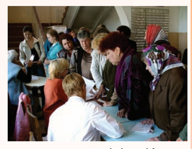
syringes were given to a nearby hospital for its use. Education and screening for diabetes, hypertension, obesity, asthma, and heart disease were conducted.

Nyazepetrovsk City In the southern foot of the Ural Mountains is the rustic Chelyabinsk region of Russia. A Sathya Sai medical camp was held on August 5-12, 2006, in Nyazepetrovsk city in the Chelyabinsk region. About 200 Sathya Sai volunteers from Ukraine, Kazakhstan, Belarus, the UK, and the USA participated in the camp. Of these, 96 were medical personnel. A total of 7,000 patients were seen during the eight days of the camp. Medications and 1,000 pairs of eyeglasses were given to patients, and 7,500