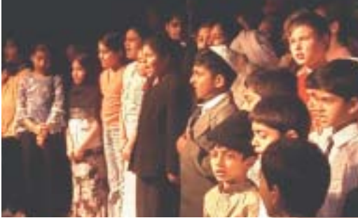
United States of America