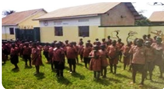
Students at the Sathya Sai School of Uganda

and at school. The school also organizes a "Walk for Values" and voluntary service to the community programmes, while tree planting is also major activity of the school. A five-year development plan emphasizes infrastructural development which started in the year 2021. The Sathya Sai School of Uganda has maximized the use of the land and started a farming project. All vegetables have been used to make nutritional meals for the students.