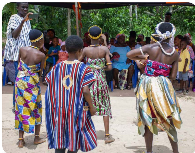
Traditions and Culture day at the Sathya Sai School of Ghana

The school has developed over the years through the assistance of the African Institute of Sathya Sai Education, which has delivered teacher training programmes. It has a strong and vibrant Parent Teacher Association (PTA), which has contributed to improving the moral standard of students to a high pedestal. The academic standard of the Sathya Sai School of Ghana is very high. A five-year development plan began in 2021, focusing on infrastructural development since the school presently has no classrooms for the Junior High School department.