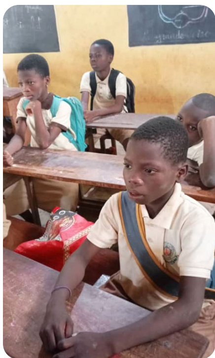
Students absorbed in lessons at the Sathya Sai School of Abomey, Benin

The number of students is growing, from the class of beginners to the third level, called CE2 in Benin. The local population is eager to enroll their children in the school, because of its reputation for providing quality education. Since 2021 there have been many challenges, but with the generous support of the SSSIO World Foundation another place was acquired to carry out the reconstruction of a new school which will open at the end of September 2025.