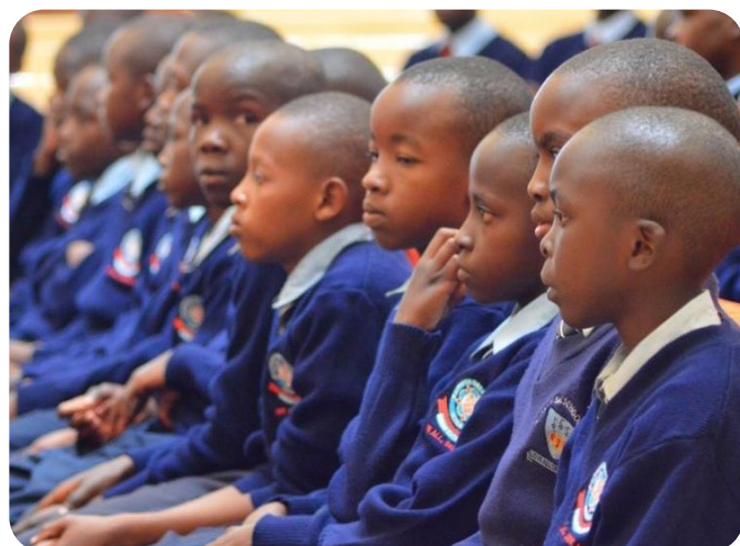
Students of the Sathya Sai School of Kisaju, Kenya

rooms, and a multipurpose hall to name but a few. It is equipped with 16 classrooms, modern Chemistry, Biology, Physics and Computer laboratories and two libraries, Administration offices, dormitories, spacious dining halls, and kitchens. The school is proud to announce that it currently has 284 students.