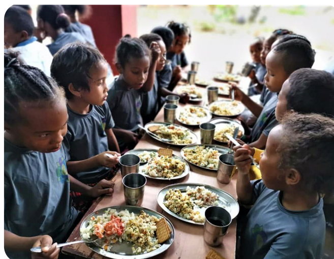
Lunch time at the Sathya Sai School of Antananarivo

Go-green initiatives are also encouraged in the backyard of the Sathya Sai Primary School where children and school staff are delighted to care for a garden of flowers, fruits and vegetables for the needs of the school and also to share with the neighbouring people in need. Every year a tree planting program is organized, and from 2023-2024 1700 trees have been planted. In June