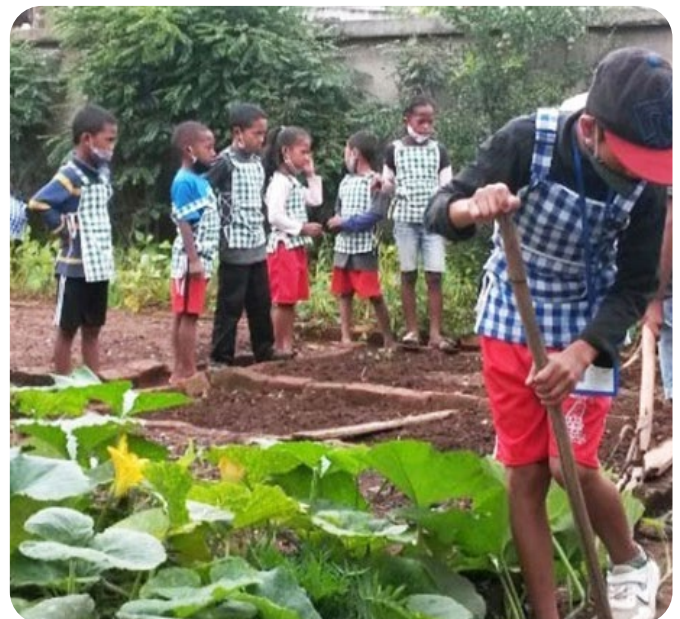
Gardening lessons at the Sathya Sai School of Antananarivo, Madagascar