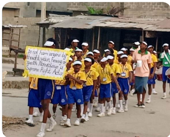
Students from the Sathya Sai School of Lagos, Nigeria participating in the annual Peace Walk

Village, Ajah. Basic infrastructures such as classrooms, drinking water and washrooms were constructed. Today the Sathya Sai School of Lagos is a registered school, approved by the Lagos State Government. It has 166 pupils with 12 full-time qualified teachers, five part-time teachers and seven support staff. A variety of subjects recommended by the Lagos State government including French, music, computer education, sports are being formally taught as part of the curriculum subjects. The school has all basic amenities including good internet, a power back-up generator, and laptops for teachers and students. The curriculum is compliant with the Lagos State government approved syllabus.