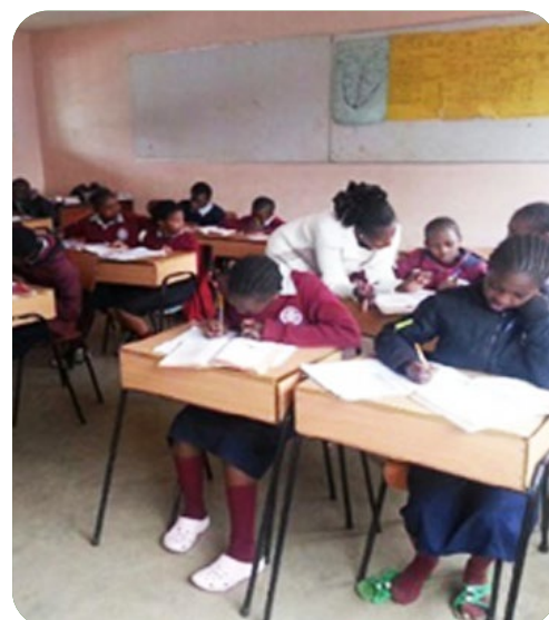
Concentrated students at the Sathya Sai School of Uthiru, Kenya

The Sathya Sai Education in Human Values programme (SSEHV) upholds all-round education, emphasizing both character development and academic excellence. It does so by promoting harmony in thought, word and deed, and by encouraging students to discern and to be kind and compassionate, as they tune into the unifying potential of Human Values. Sathya Sai Schools, Institutes, curricular, co-curricular and community SSEHV programmes provide an ideal ground for nurturing and spreading these values, which include respect, kindness, trust, tolerance, honesty, understanding, among many more. The programmes aim at making students into exemplary citizens and professionals, conscious of the need to embed values in their day-to-day lives, and radiate peace at the individual, community, national, and global levels.