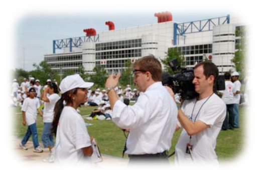
Walk for Values USA - Houston Committee member being interviewed by a FOX 26 News Reporter

What's next for the Houston Walk for Values Committee? Reflect upon the lessons learned and devise ways to improve it. Figuring out what worked and what didn't work is the first step. Planning on how to improve the Walk is the next big task. How can we enhance participation? How can we broaden the outreach to reach to more communities? What improvements can be done to the opening and closing ceremonies? These are just some of the many questions that the committee will be working to find an answer to. Working harmoniously, the next Walk for Values – Houston will surpass the last one in its organization, participation and commit