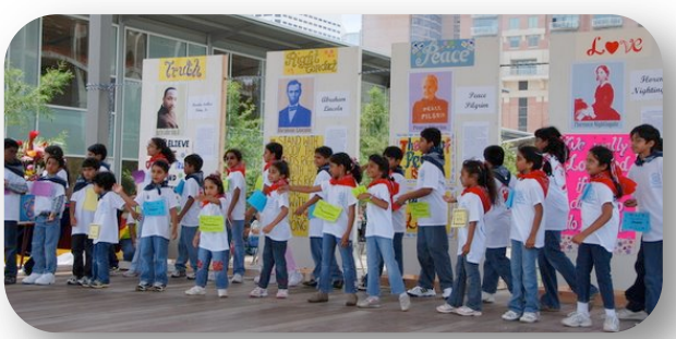
Children Dancing to "Put A Little Love in Your Heart"