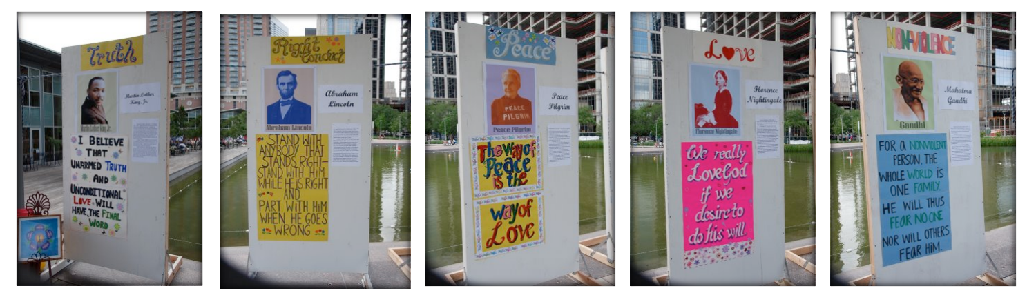
World Leaders and the values that they exemplify: Sai Spiritual Education Children created these posters and signage to instruct and inspire the participants and the general public.

After months of planning, the actual day of the walk arrived. Bright blue skies, fluffy white clouds, and sunshine with plenty of breezes prevailed as over 500 Houstonians gathered on the lush green hillside of Discovery Green Park. A registration booth was set up for participants that pre-registered as well as participants who joined the day of the walk. After participants checked in at the Registration booth, they picked up a Walk for Values shirt and hat if they hadn't done so before, and picked up a walker tag which displayed the value they were walking for. Face painting was also available for both the young and young at heart. Participants lined up on the grassy hill in 5 columns, one for each value, facing a large stage. The stage was decorated with five 7 foot tall wooden stands with posters created by the SSE children with a biography of a World Leader that exemplified each value presented: Truth - Martin Luther King, Right Conduct – Abraham Lincoln, Peace – Peace Pilgrim, Love – Florence Nightingale, Nonviolence – Mahatma Gandhi.