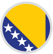
Bosnia and Herzegovina