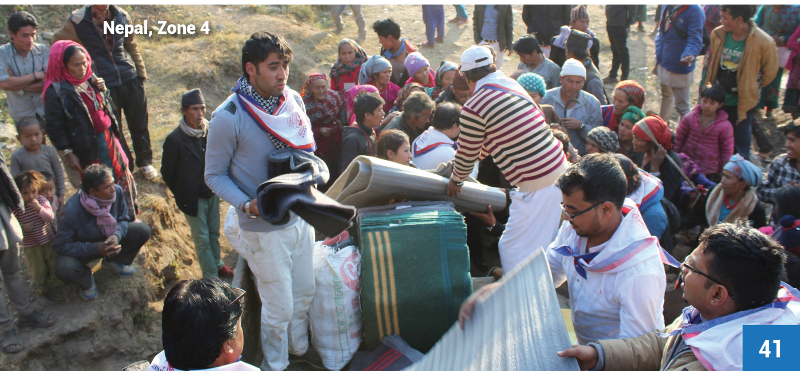
Nepal, Zone 4

Sathya Sai youth from several countries, including medical professionals, organised medical camps across the Zone. Every month, the youth of Philippines participated in local healthcare initiatives. Malaysian youth rendered loving service to animals and, in one instance, rescued 50 abandoned dogs. In Thailand, Sathya Sai youth helped provide meals to the residents of slums and to refugees. In Lao PDR, Sathya Sai youth were instrumental in setting up a new Sathya Sai School in Vientiane and also rendered loving services to the blind. In Singapore, youth organised a “Games Day” where human values were taught to local children through sports and games.