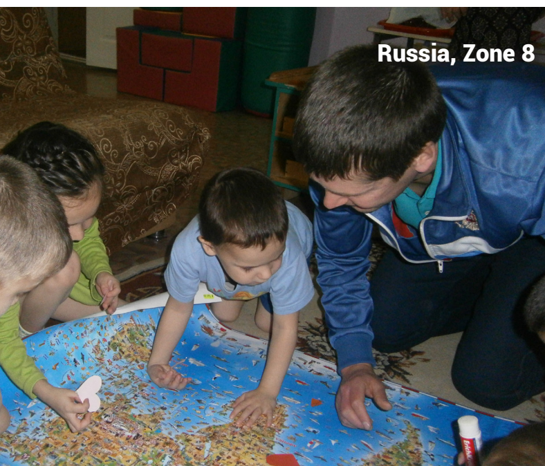
Russia, Zone 8

Sathya Sai youth of Ukraine and Russia continued their tradition of visiting children in rehabilitation centres and orphanages and conducting classes in SSEHV.