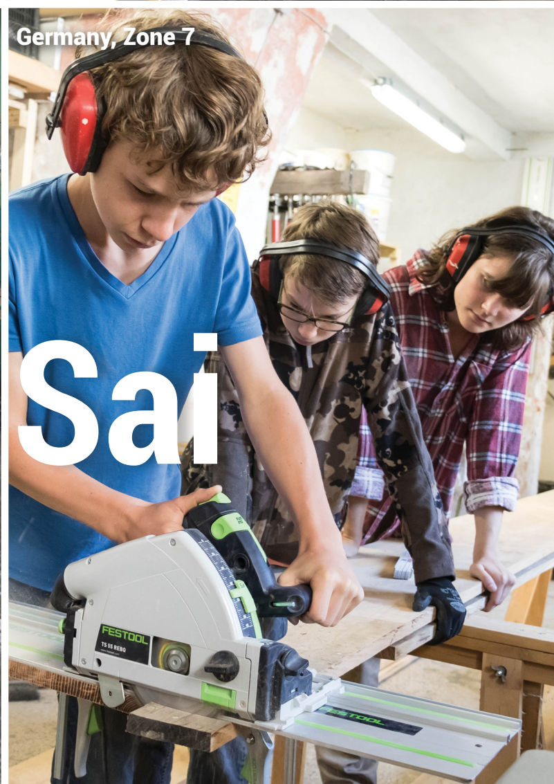
Germany, Zone 7