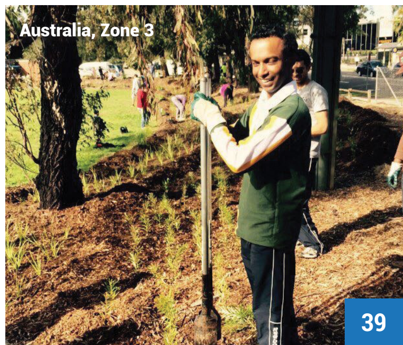
Australia, Zone 3