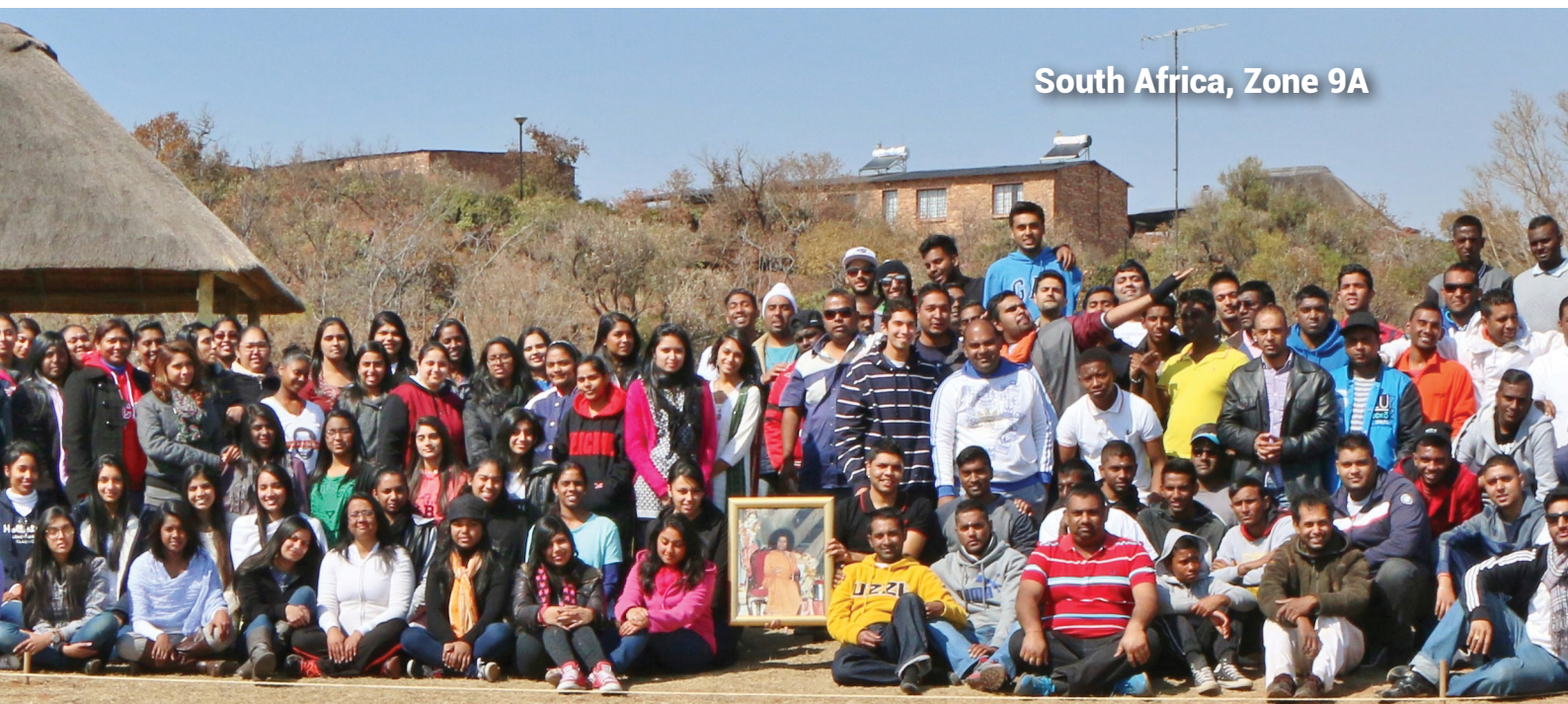
South Africa, Zone 9A

To enjoy the natural beauty and splendour of the island of Mauritius, about 75 Sathya Sai youth from all across the island nation joined for a hike at Le Pouce mountain. They held discussions and exchanged information about their spiritual journey at the end of the outing.