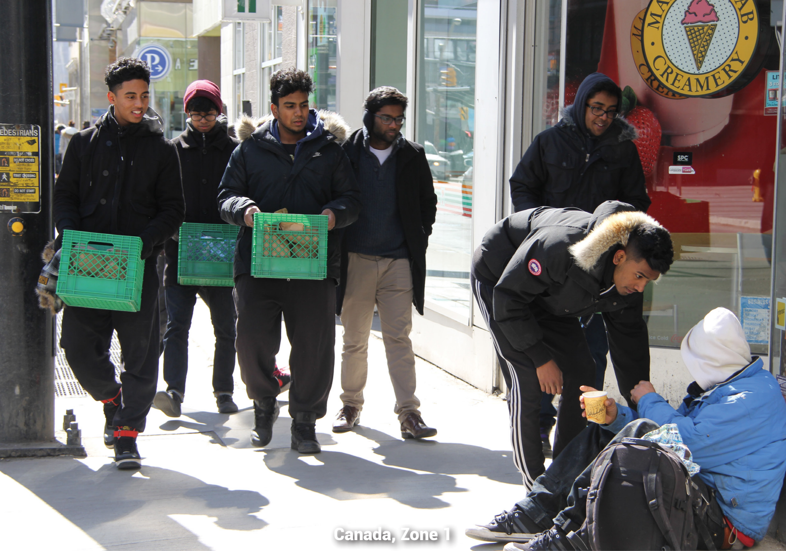
Canada, Zone 1