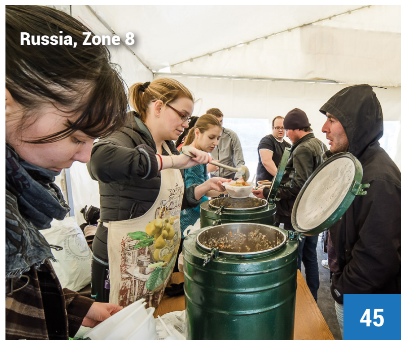
Russia, Zone 8