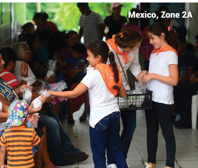
Mexico, Zone 2A

Sathya Sai youth of Zone 3 participated with enthusiasm in a Pre-World Conference in Sydney in June 2015. In Australia, the youth, in partnership with another group, organised regular visits to a local park in Brisbane for disadvantaged and homeless children. In addition, Australian youth spearheaded four service projects, including serving residents of nursing homes, distributing food to refugees, planting trees to protect and enhance the environment, and providing instructions on life skills to refugees and immigrants.