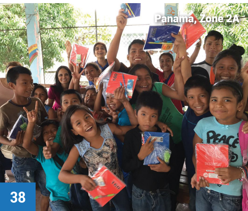
Panama, Zone 2A

In El Salvador, youth provided lessons in human values to community members. Sathya Sai youth escorted urban children on excursions to the countryside every month, where they played games and taught meditation, care for the environment, and how to make imitation spider webs. In El Salvador, the youth held a meeting in August 2015 to deepen their spiritual knowledge and discuss the work of the SSIO. In Guatemala, the youth gathered in February 2016 to learn about the life and works of Sathya Sai Baba and the functions of the SSIO. In Panamá, Sathya Sai youth offered classes in human values.