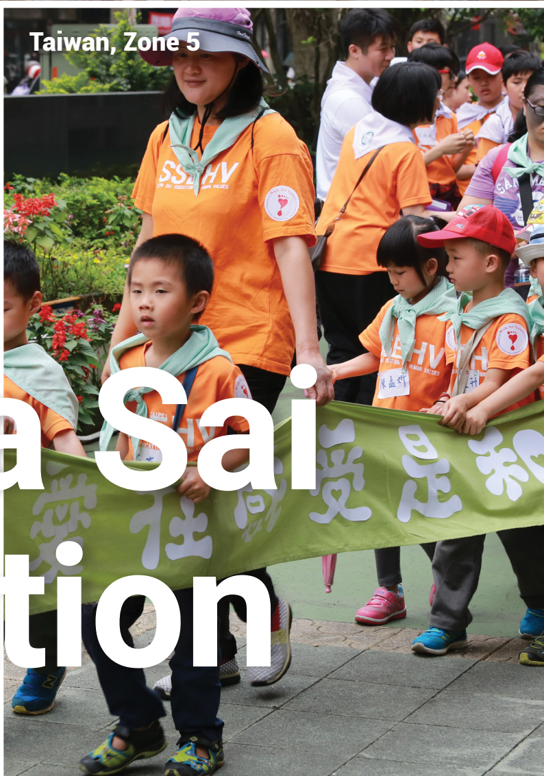
Taiwan, Zone 5