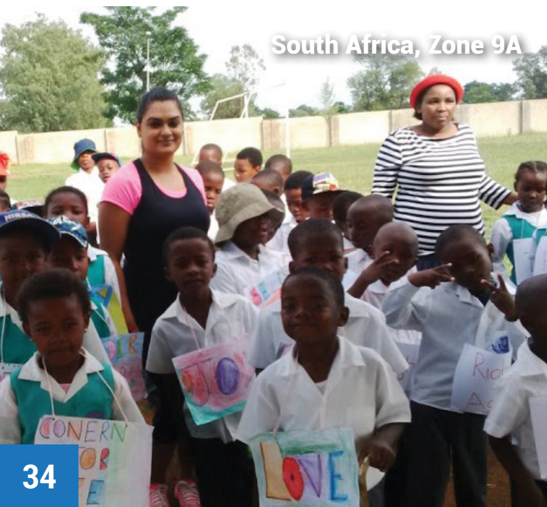
South Africa, Zone 9A

Morocco: Three trained teachers in Casablanca implemented SSEHV in a school with 193 children, ages 6–12.