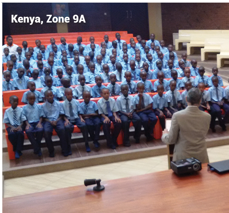
Kenya, Zone 9A