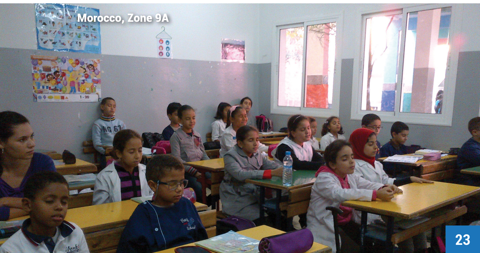
Morocco, Zone 9A

This report briefly summarises the educational activities of the SSE, SSEHV, ISSEs and Sathya Sai Schools worldwide.