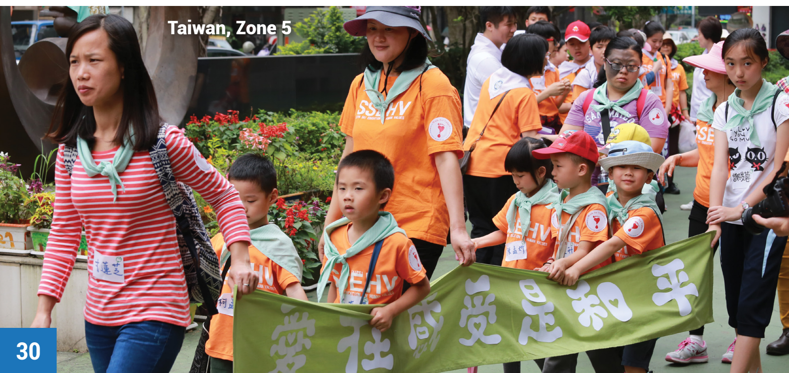
Taiwan, Zone 5

Japan: The ISSE organised a delegation of 50 educators from Shizuoka University, Shizuoka Institute of Science and Technology, and the Educational Board of the Shizuoka Prefecture, to visit Prasanthi Nilayam. An SSE Camp was held at the Tokyo Sathya Sai Centre. SSE teachers and students of the SSSIHL participated in the Sakura Science Project.