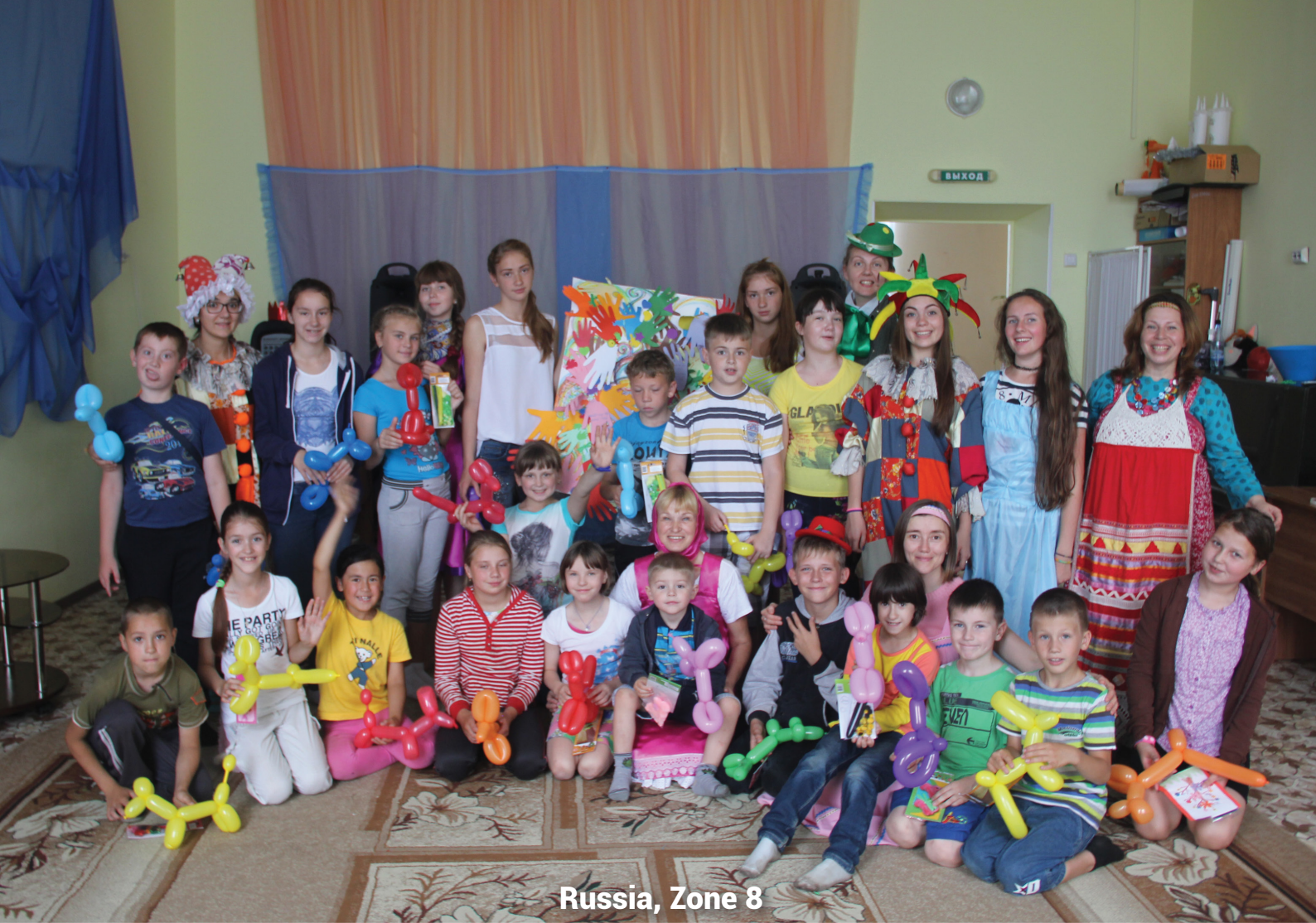
Russia, Zone 8