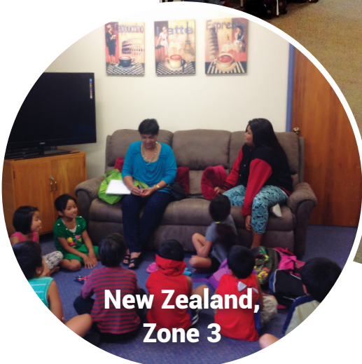
New Zealand, Zone 3