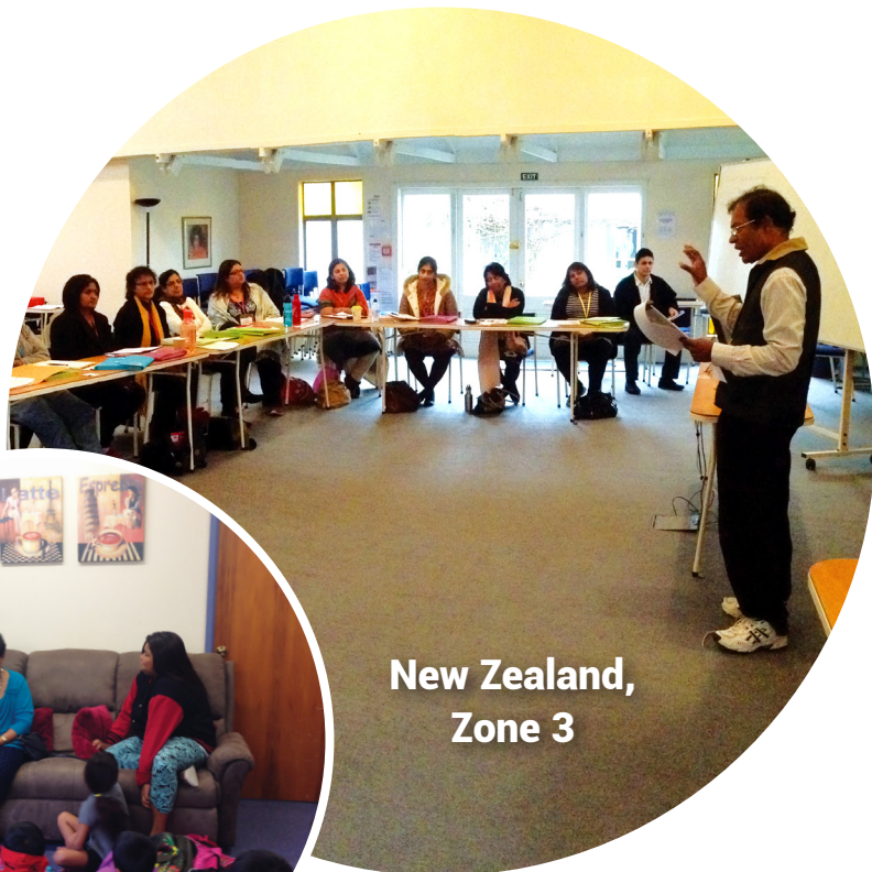
New Zealand, Zone 3

New Zealand: In addition to SSE teaching and training, the ISSE New Zealand focused on developing high level competence for trainers and facilitators by having them take a government accredited qualification of Certificate 4 in Training in Education. This group of qualified trainers are preparing to launch several SSEHV initiatives.