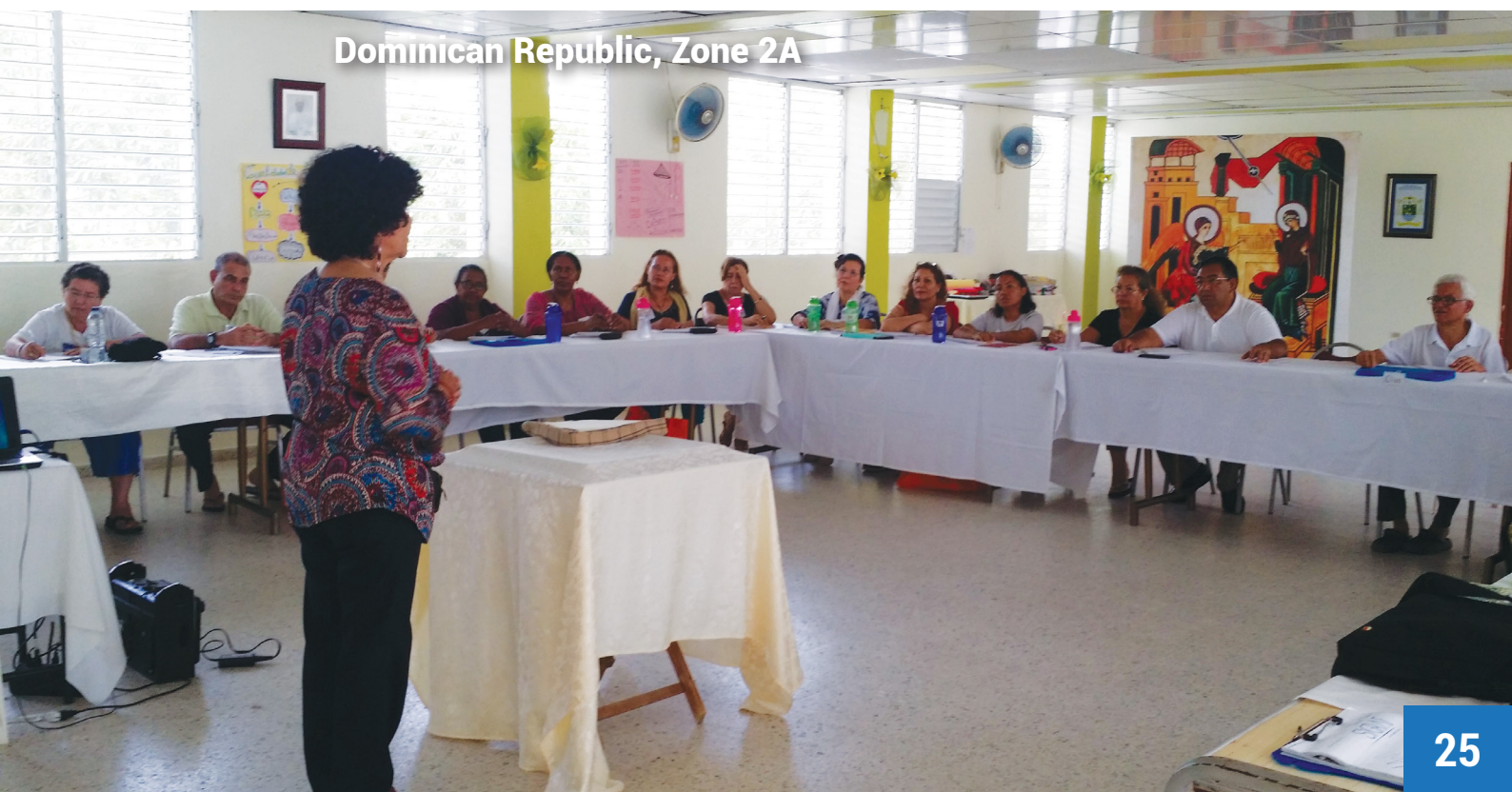
Dominican Republic, Zone 2A

Guatemala: The School provided services to a centre for mentally handicapped children, a senior home, and a homeless shelter.