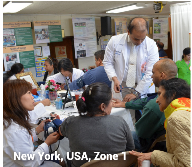
New York, USA, Zone 1