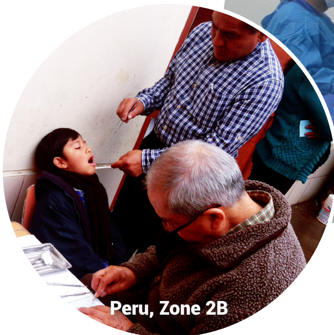
Peru, Zone 2B

On 31 st October 2015, 20 patients had cataract surgeries in Caracas, through the efforts of SSIO specialists and volunteers, with assistance from the Institute of Ocular Microsurgery, Caracas.