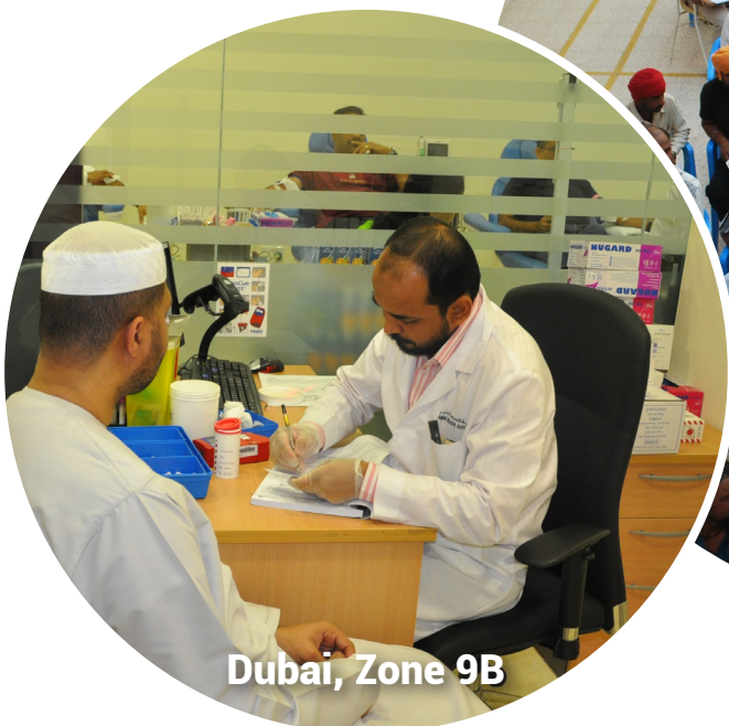
Dubai, Zone 9B