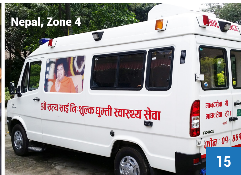
Nepal, Zone 4