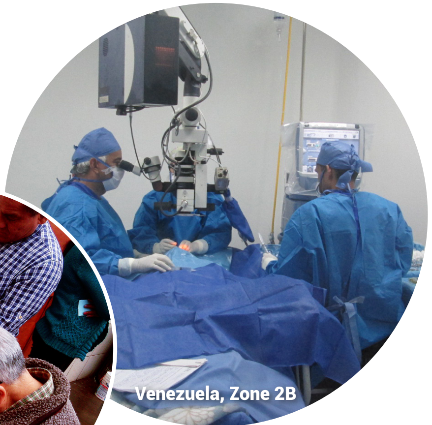
Venezuela, Zone 2B