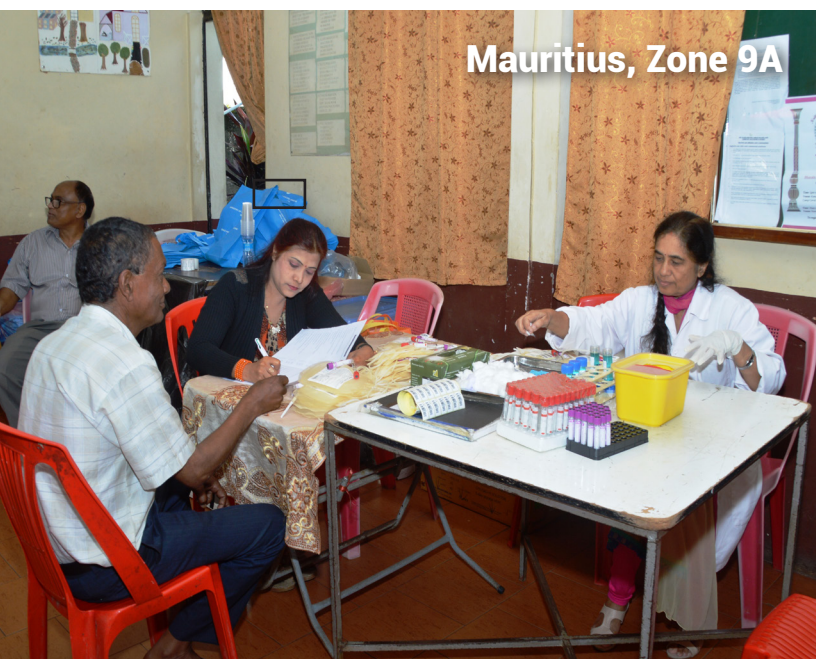
Mauritius, Zone 9A

In two separate provinces, Gauteng and KwaZulu-Natal, a total of 8,821 SSIO members attended blood donation camps where 6,838 pints of blood were collected.