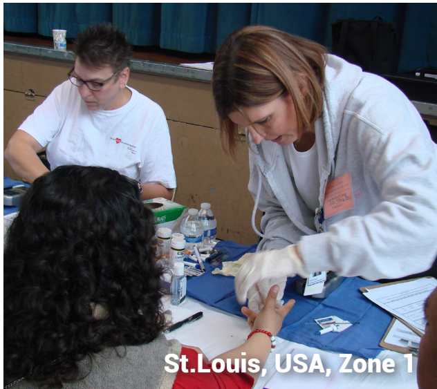
St. Louis, USA, Zone 1