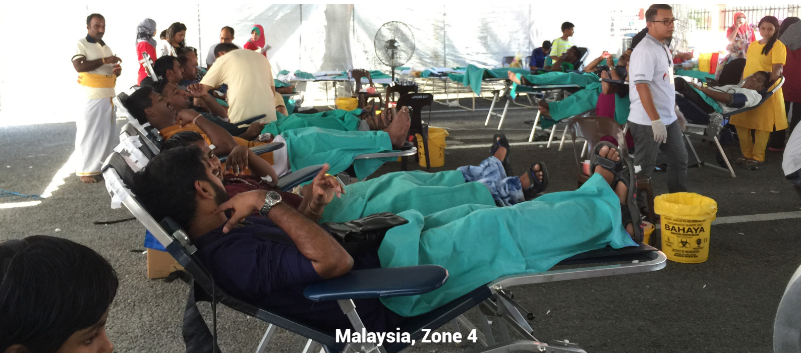
Malaysia, Zone 4

On 25 th April 2015, a massive earthquake measuring 7.4 on the Richter scale shook Nepal, leading to severe destruction in the Kathmandu valley. SSIO doctors rendered medical services as part of the disaster relief efforts. Medical camps were immediately organised at four locations, and doctors went door-to-door offering medical services in 11 villages in remote mountainous areas. Pregnant women and postpartum mothers living in government tents were brought to the Sathya Sai Health Centre for ultrasound examinations, blood tests and dental services. In total, more than 5,000 patients were served in medical camps by a team of 11 medical professionals and 30 paramedics, assisted by general volunteers.