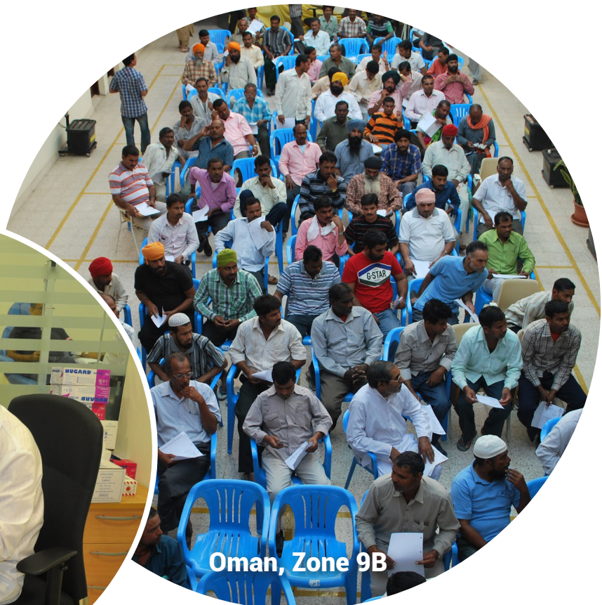
Oman, Zone 9B