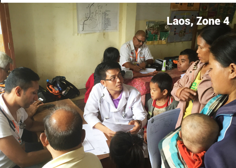
Laos, Zone 4