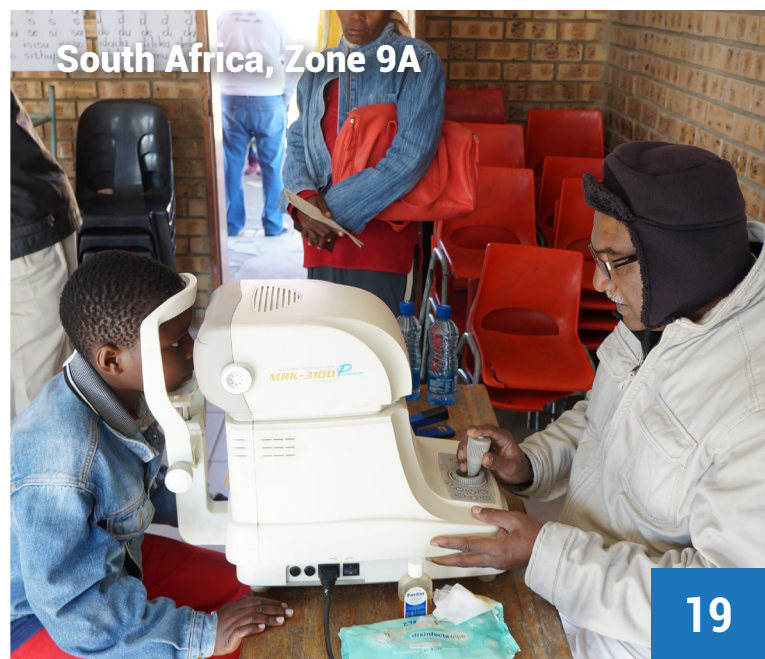
South Africa, Zone 9A